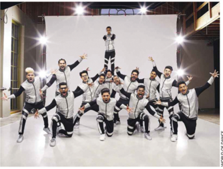
WORLD OF DANCE

10 World of Dance Live The World of Dance Live Tour, a live interpretation of the NBC dance competition show, "World of Dance," continues on its tour with a stop in Westbury. The show features dancers from all genres including the 2019 million-dollar winners from Mumbai, The Kings and Unity LA, above, 8 p.m. Wednesday at the NYCB Theatre. INFO 516-247-5200, thetheatreatwestbury.com ADMISSION Tickets start at $45