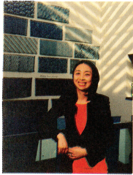
Traditional woven textiles, dyes and blue jeans in 'Seas of Blue' at the Wang Center.