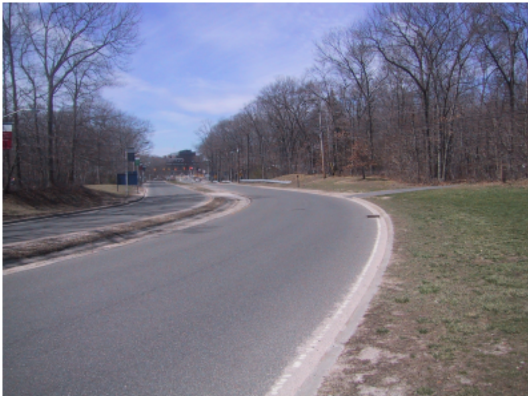
Figure 3: The view west from the end of Daniel Webster Drive towards the main entrance to campus. Note the lack of any significant shoulders.