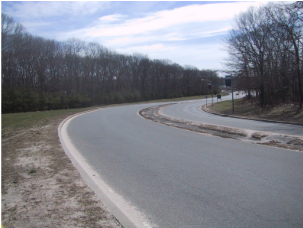
Figure 2: The view south from the end of Daniel Webster Drive along Health Sciences Drive towards the hospital. Note the lack of shoulders. The culvert is on the right, about 15 yards up the road. Traffic permitting, it is possible to ride through this without dismounting to reach the southbound lanes.