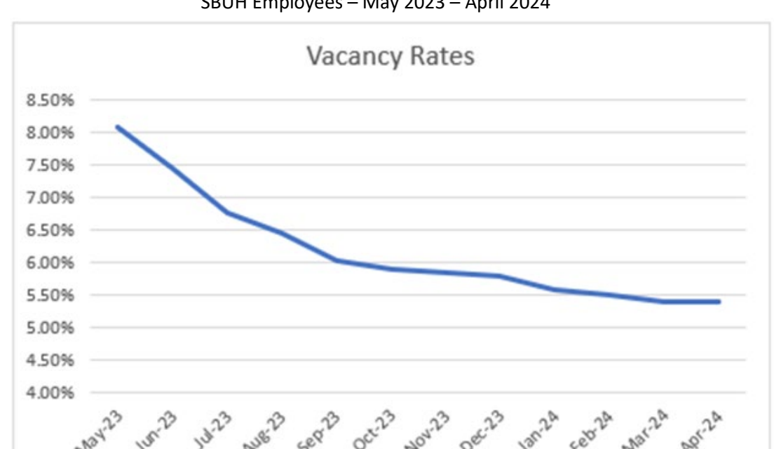
SBUH Employees - May 2023 - April 2024

Recruitment and retention remain top priorities, and staffing levels continue to increase while vacancy rates continue to decrease.