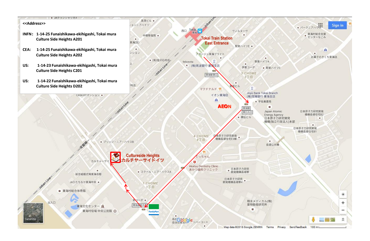
Figure 1: Map