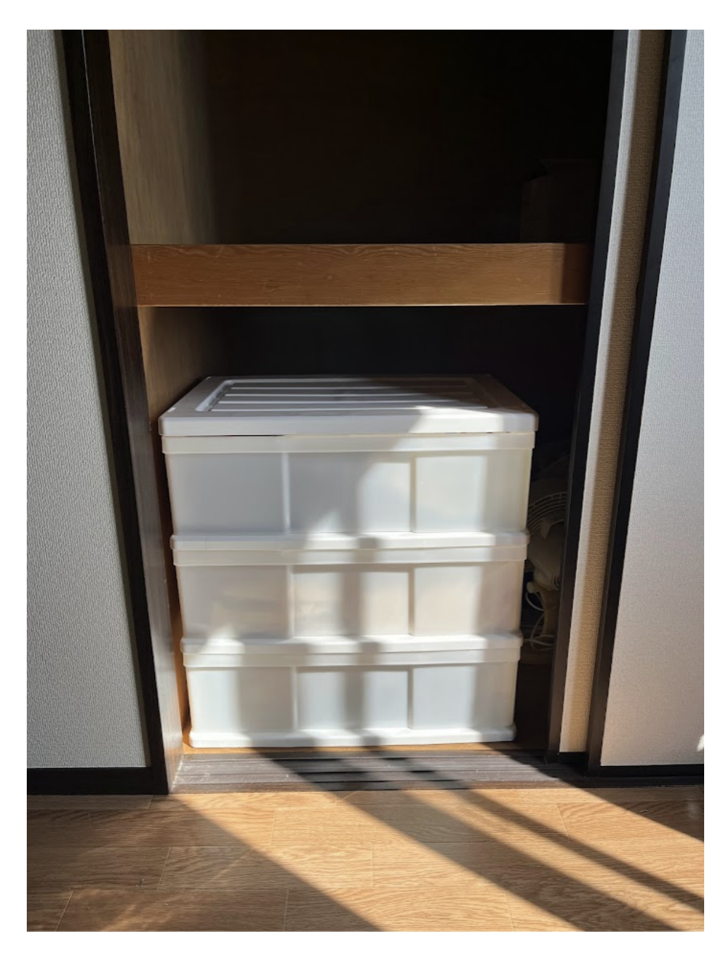
Figure 8: Drawer in D201.