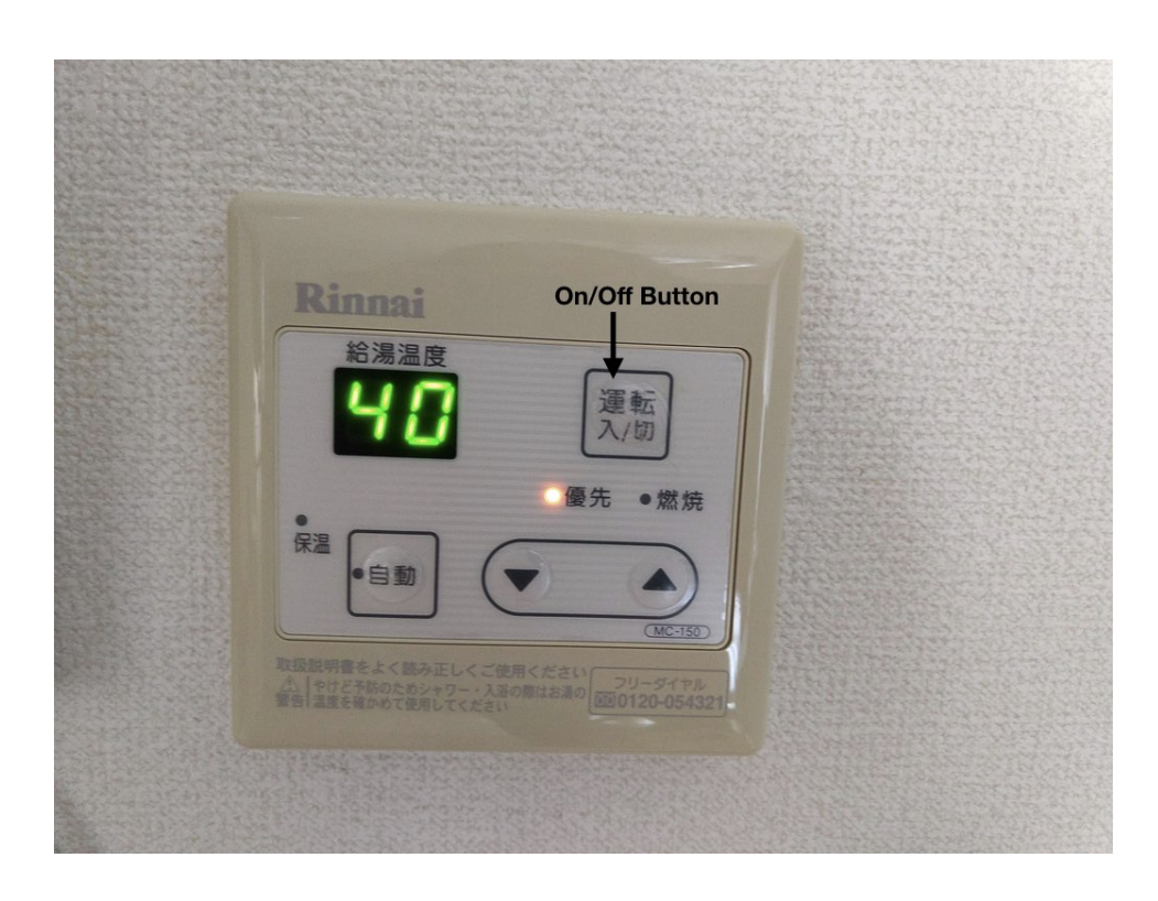
Figure 4: Hot Water Heater