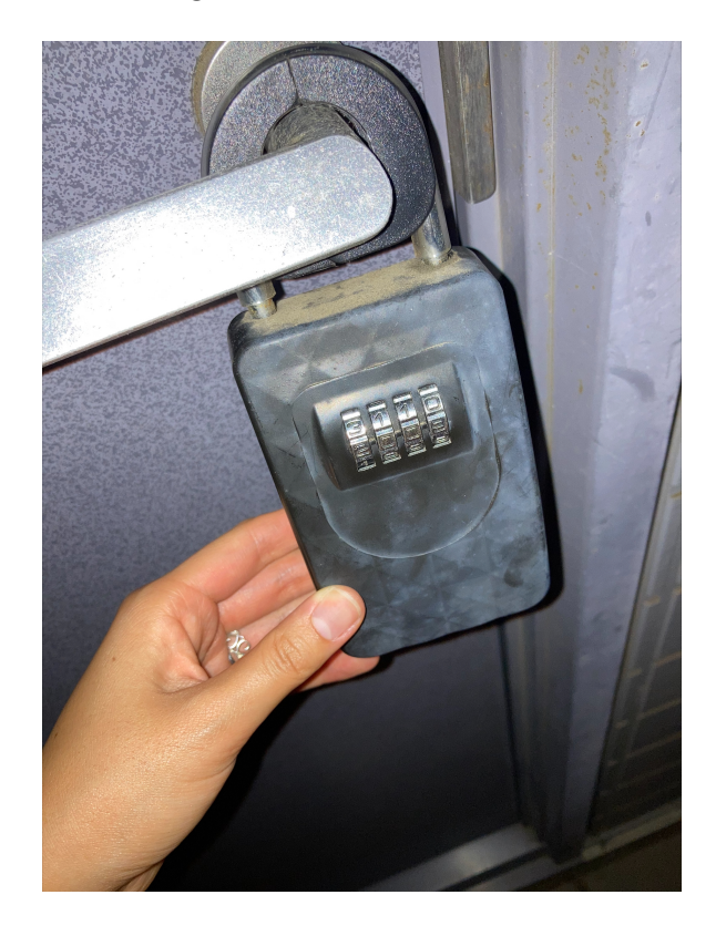
Figure 3: Keybox outside C201 door.

There is a key box outside of CSH apartment C201 that has a key for C201. Once you are inside of C201, you should find the rest of the keys for C201 and D202, as well as the car key. The code for the box is 2009 . A photo of the key box is shown in Fig.3.