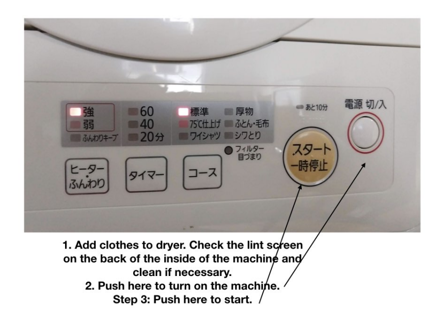
Figure 7: Dryer

Note that there is a drain pipe that runs out below it into a bucket to collect condensation. Make sure that it drains into the bucket. Clean the filter inside the dryer after every use.