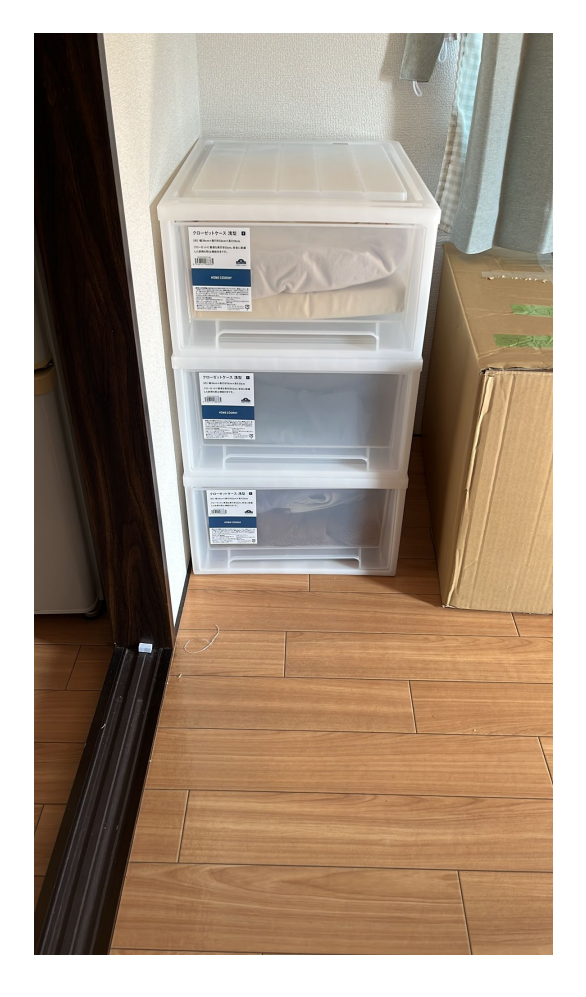
Figure 9: Drawer in D202.