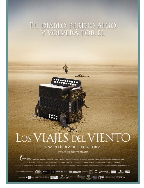
The wind journeys (2009)