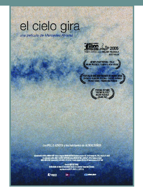
The sky turns (2005)