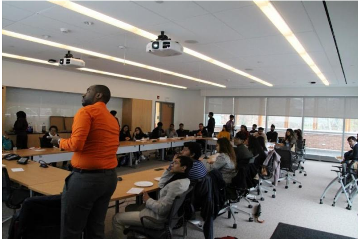
Local high school students learn about coding and computer science careers.